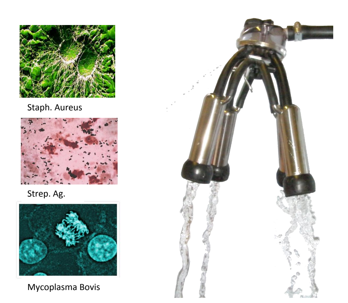
ClusterClean thoughly disinfects each cluster automatically

Each cluster can carry infections from one cow to the next, spreading contagious mastitis at an alarming rate.