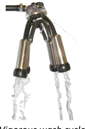
Vigorous wash cycle

'Saving labour & reducing the spread of mastitis quickly add up to healthier profits.