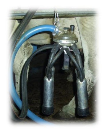
Cluster detaches smoothly