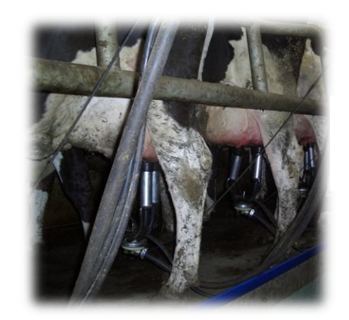
ClusterClean – designed speed up parlour routine.